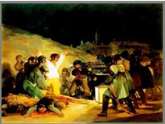
Figure 2 Figure 3